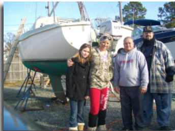
Some of our crew of volunteers down at the boat-yard

receiving new deep cycle batteries for the island churches of San Blas.