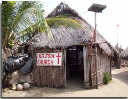
Church on Korbiski Island with solar panel by entrance.